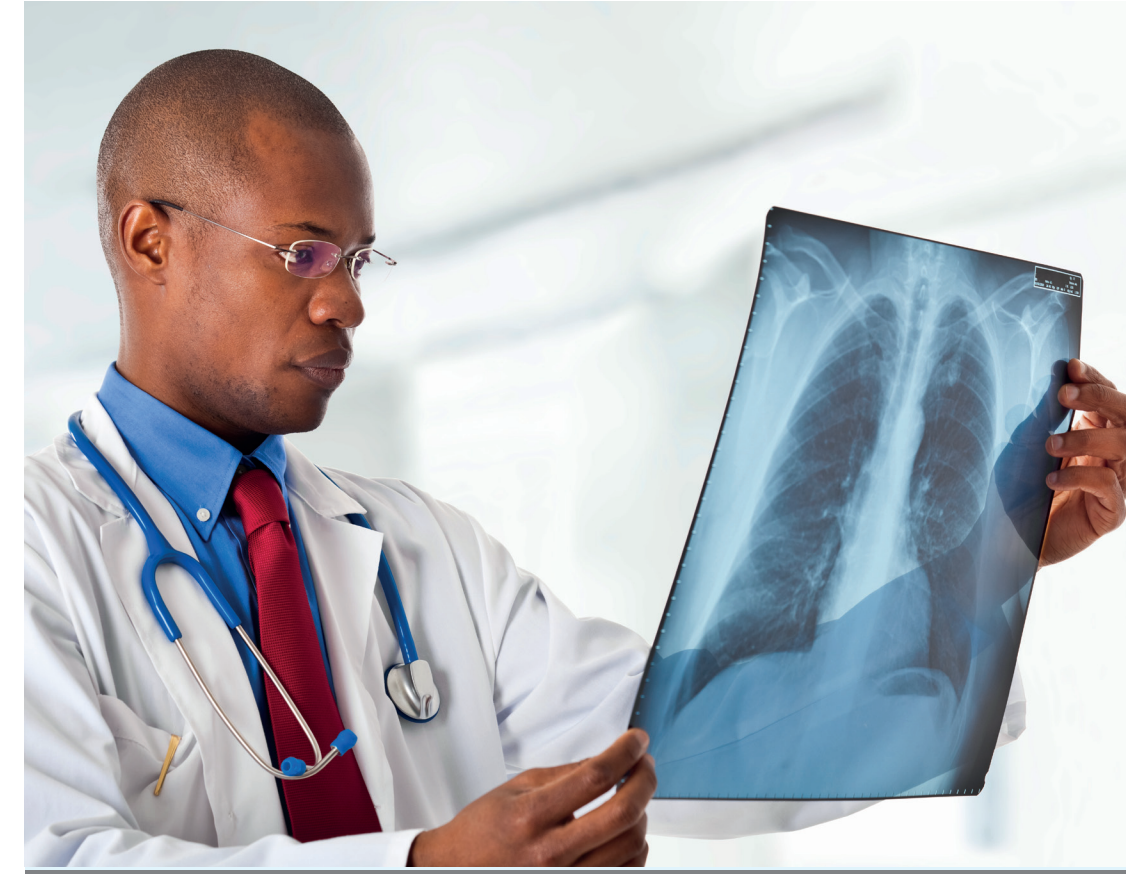
BME NHS staff are more than 50% likely to be disciplined than their white counterparts